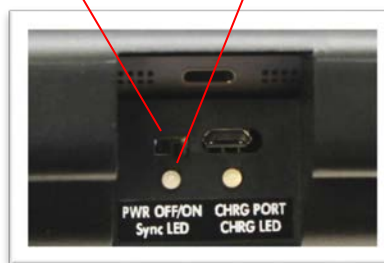
Power OFF/ON Switch Bluetooth LED